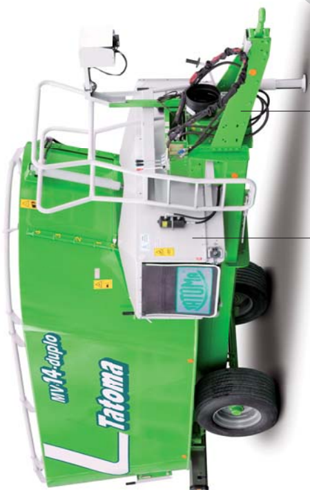
high adjustable draw bar hydraulic stand