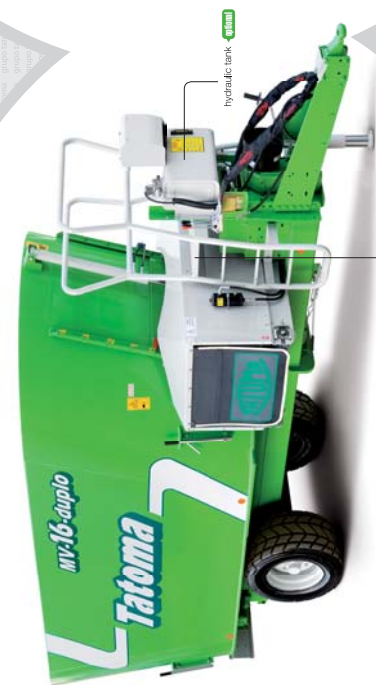
double access star with large platform which allows safe observation of the mixing process by one or more persons